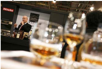
MORS Gold Pin Competition