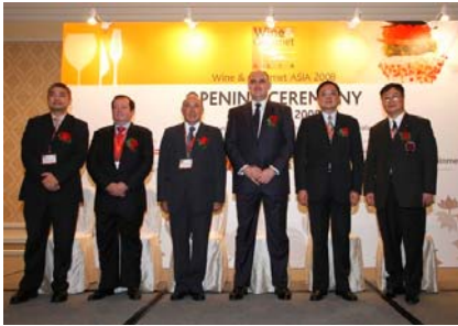
Photo Snapshots Trade Exhibition