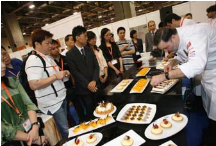
Seapower Whisky Masterclass