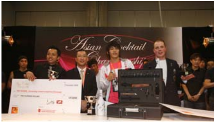
Wine & Gourmet Asia Organizers: Culinary Masterclass by DKSH