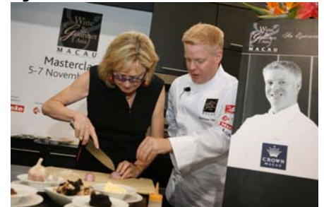
Behind the Scenes Visit Tour