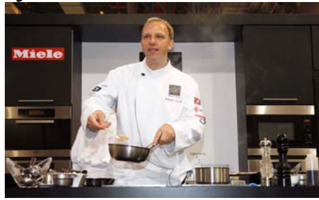
Portuguese Wine Masterclass